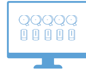
Monitor all dispensers within a designated area to ensure timely refilling