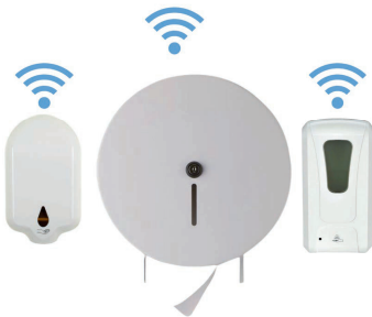
Dispensers installed with our smart tracking technology